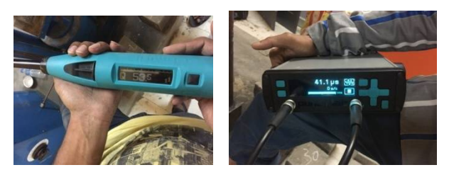
(a) (b) Fig.4- (a) Rebound hammer (b) Ultra sonic pulse velocity.

Table-5: Non destructive test results: Rebound hammer and Ultra sonic pulse velocity test results: