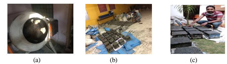
Fig.2- (a) Mixing of SCGC (b) ambient curing of SCGC (C) Mold used for casting specimens.

Sodium hydroxide solution of 5M/10M is first prepared before 24hours of casting the samples with sodium silicate and this should be used within 36 hours. Mixing was carried out in drum mixer, the dry materials like cementitious binder materials and aggregates were first dry mixed for 5 minutes. The alkaline solution was then poured to dry mix and this mix was mixed for 5 minutes. The SCGC in its fresh state is transferred to molds. Then this specimens were cured ambient temperature and after 24 hours this specimens were de-molded and once again subjected to ambient curing.